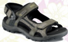
Off Road Lite