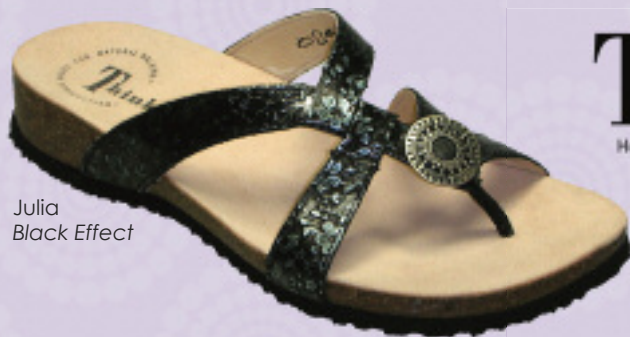
Julia Black Effect