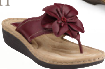
Latin Samba in raspberry