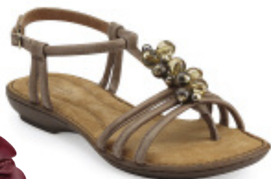
Brisk Bangle in brown