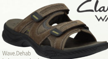
Wave.Dehab in brown nubuck