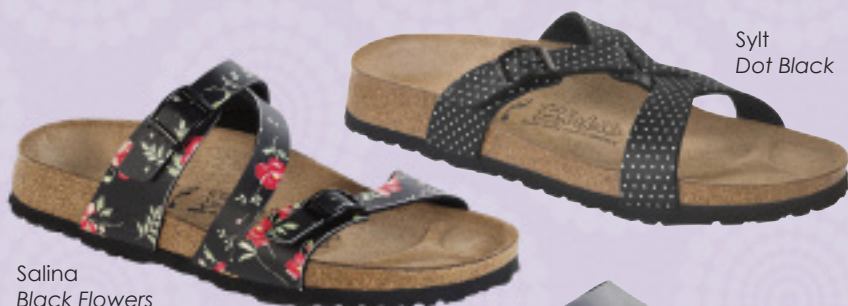
Salina Black Flowers