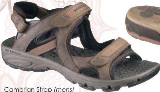
Cambrian Strap (mens)