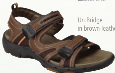
Un.Bridge in brown leather