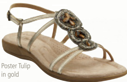
Poster Tulip in gold