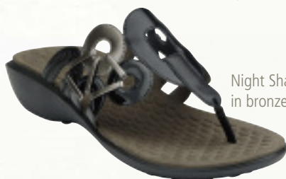
Night Shade in bronze