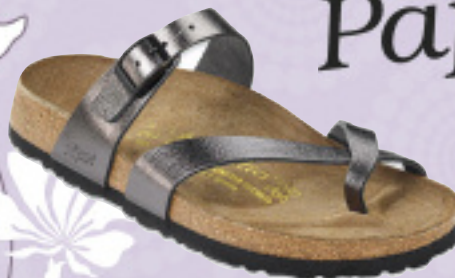
Gizeh Snake Brown