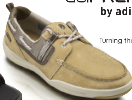
Turning the Tides