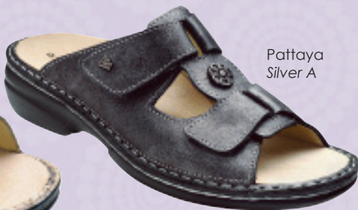
Pattaya Silver A