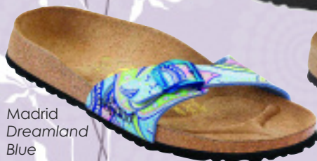
Madrid Dreamland Blue